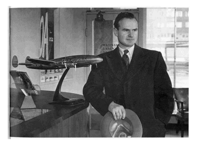
Fig. 3. With a model of the plane for his transatlantic flight.