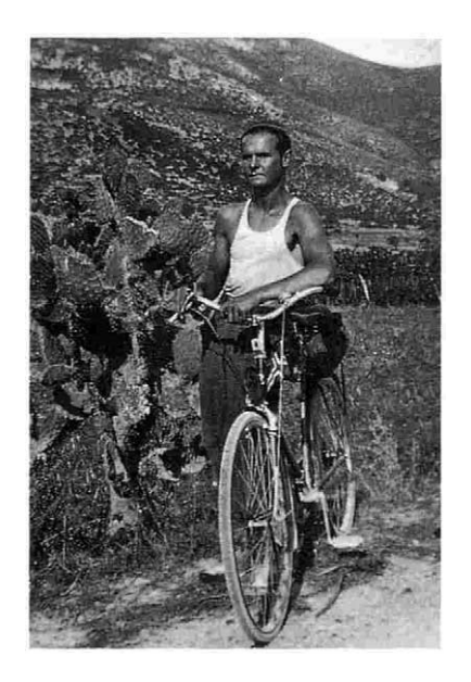
Fig. 2. With the well travelled cycle.