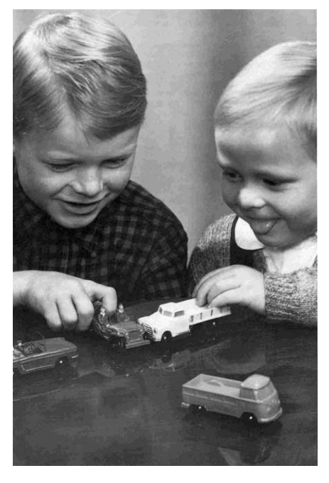
Fig. 5. Tomte cars.

on the death mask of a renowned girl who had been found drowned in the River Seine in Paris. The death mask had become famous because of the girl's wistful, enigmatic and peaceful countenance. She was beautiful but not sexy. The clothes that the manikin was dressed in was also a master stroke—a track suit was attractive and embodied a concept of fitness. Putting the manikin in a dress would have been a disaster (Figs. 6–8).