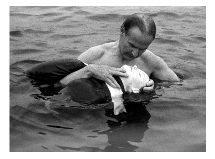
Fig. 8. Resusci Anne.

This enterprise attracted international attention, and Norway emerged as a pioneering country in the history of life-supporting first aid.