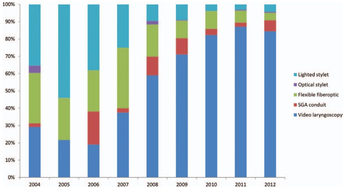
Fig. 2. Rescue techniques attempted over time. This diagram illustrates the proportional use of each studied rescue technique of interest over time. During this period, the use of video laryngoscopy has substantially grown, while the use of all other rescue techniques has proportionally decreased. SGA = supraglottic airway.

with airway management. Depending on the variable and contributing institution, 79% (n = 1,122) of the 1,427 cases of failed direct laryngoscopy had preoperative airway examinations available for review. The final tally for data completion demonstrated that 54 to 63% of the 1,427 cases had valid preoperative airway examination details, depending on the variable. Based on the available data, 28% (n = 313 of 1,122) of the cases where direct laryngoscopy failed had two or more predetermined predictors of difficult direct laryngoscopy recorded. An episode of hypoxemia as defined by SpO 2 of less than 90% for at least 1 min around the time of intubation was observed in 372 of 1,511 (25%) rescue attempts. A total of 782 of 1,511 (52%) cases were considered “higher risk” as defined by an episode of hypoxemia, or after difficult/impossible mask ventilation, or after two failed previous attempts at direct laryngoscopy.